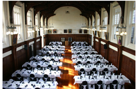
Christs College Dining Hall

Probably the most significant year since any of us were initiated into the Craft is upon us. 300 years ago on June 24th (Feast of St John), at the Goose and Gridiron Public House in St Paul's Churchyard, a group of members of four local, London Lodges came together to establish a "United" Grand Lodge with the intention to meet four times a year "in communication" and to feast.